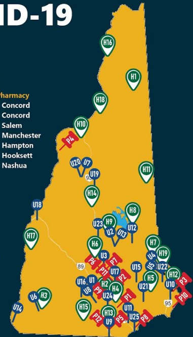
Map is for graphical purposes only, it does not represent a legal survey.